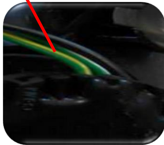
CHMSL (Yellow shown)