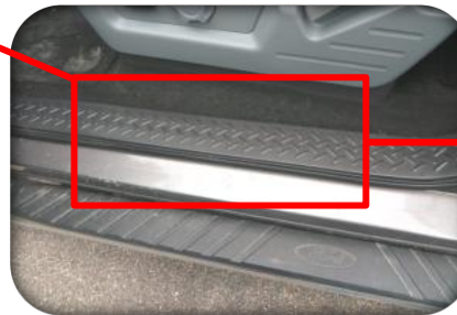
Keyless Wire Location