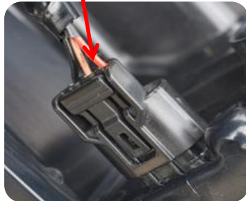
CHMSL (Green shown)